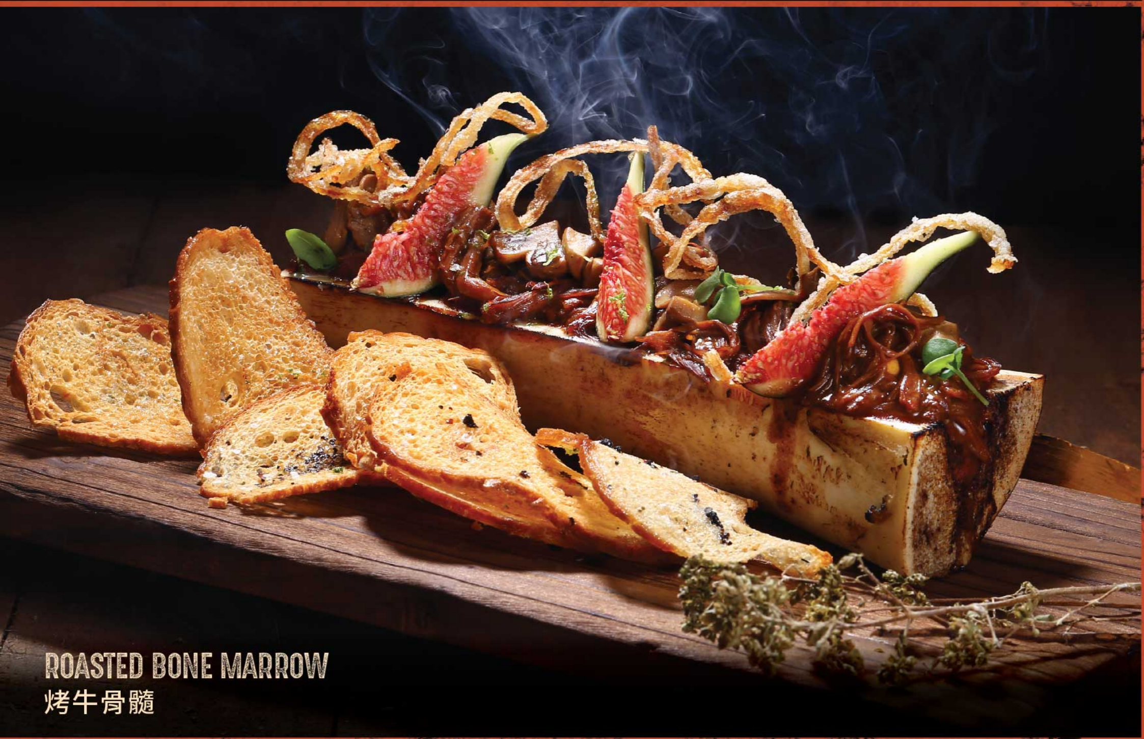
ROASTED BONE MARROW 烤牛骨髓