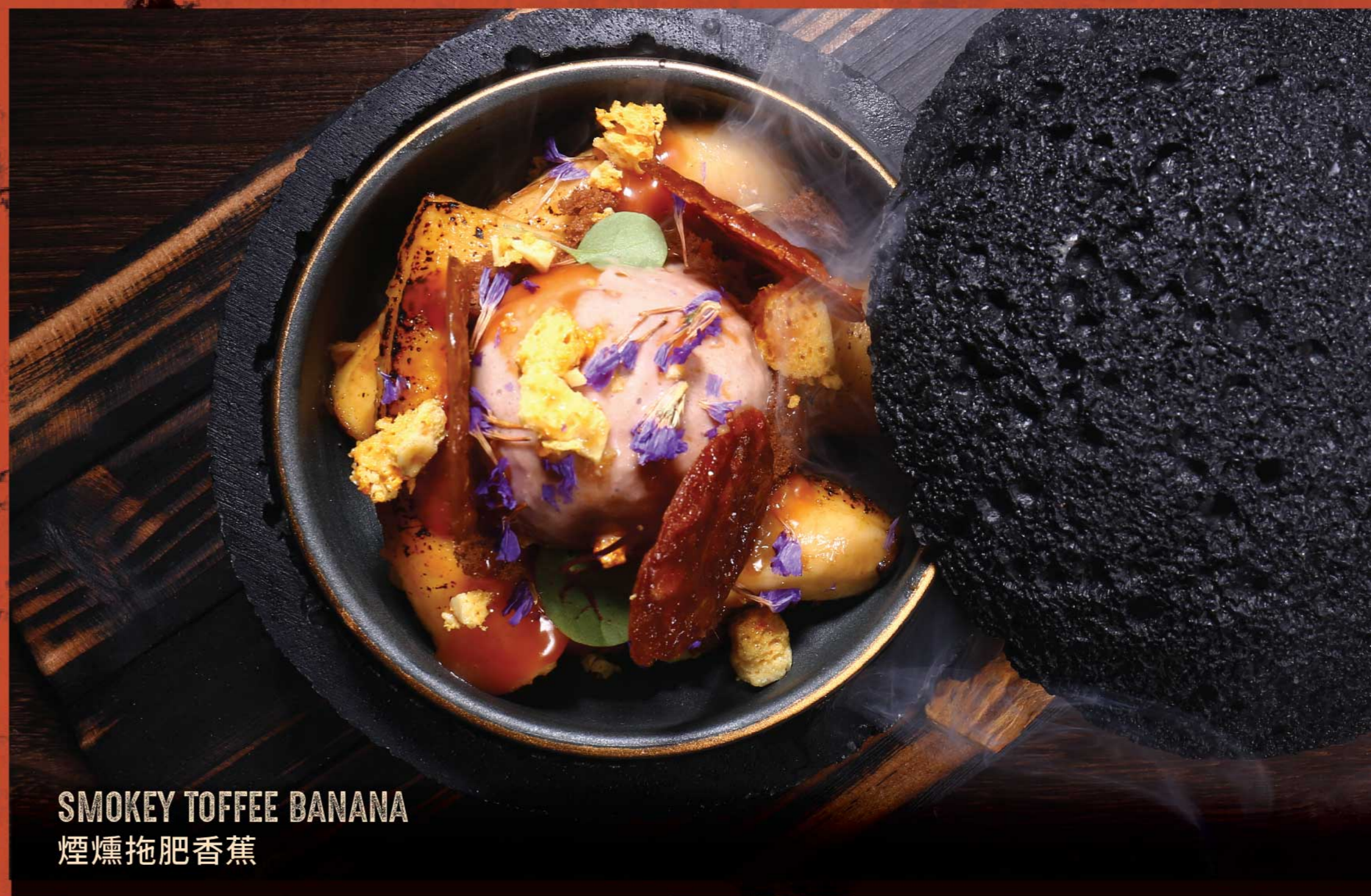
SMOKEY TOFFEE BANANA 煙燻拖肥香蕉