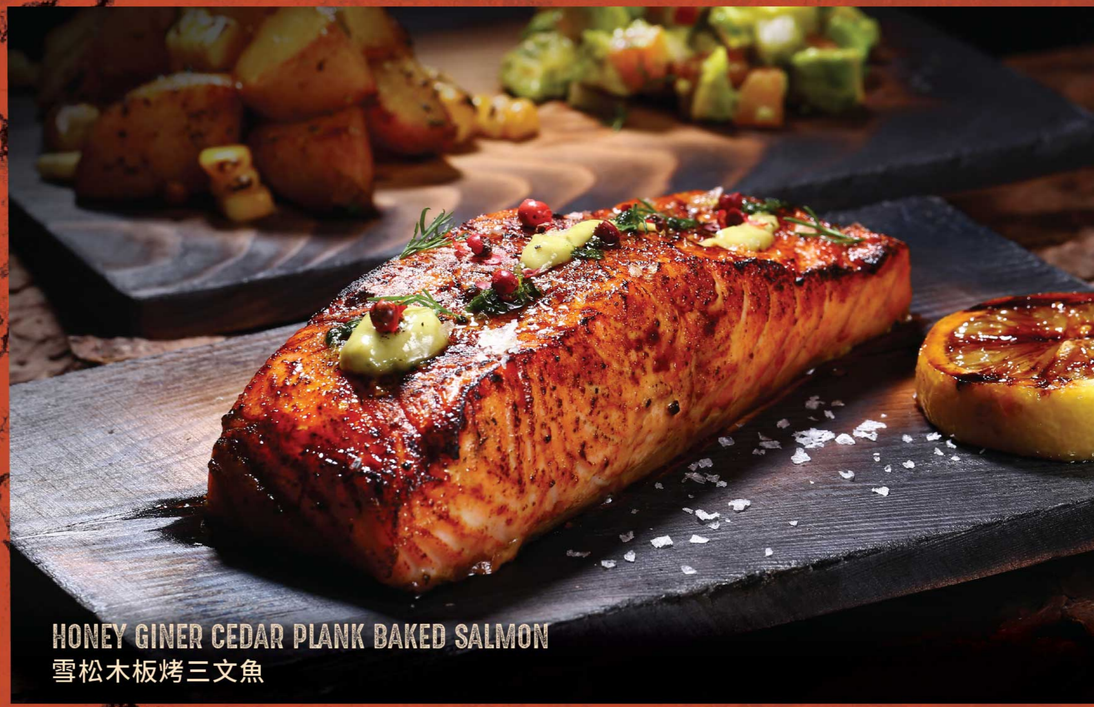
HONEY GINGER CEDAR PLANK BAKED SALMON 雪松木板烤三文魚