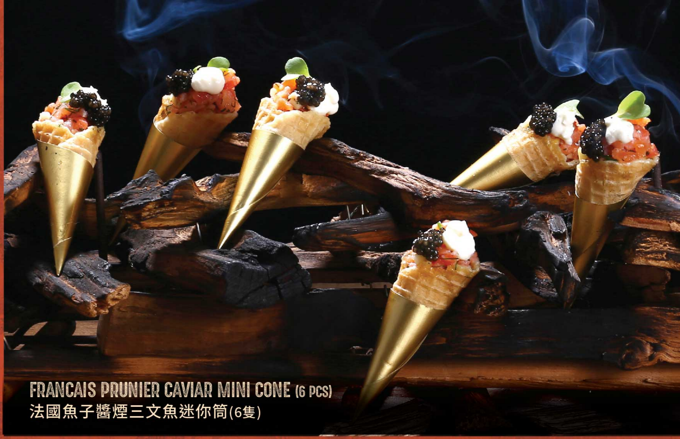
FRANCAIS PRUNIER CAVIAR MINI CONE (6 PCS) 法國魚子醬煙三文魚迷你筒(6隻)