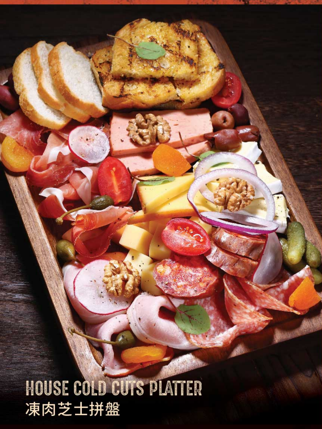
HOUSE COLD CUTS PLATTER 凍肉芝士拼盤