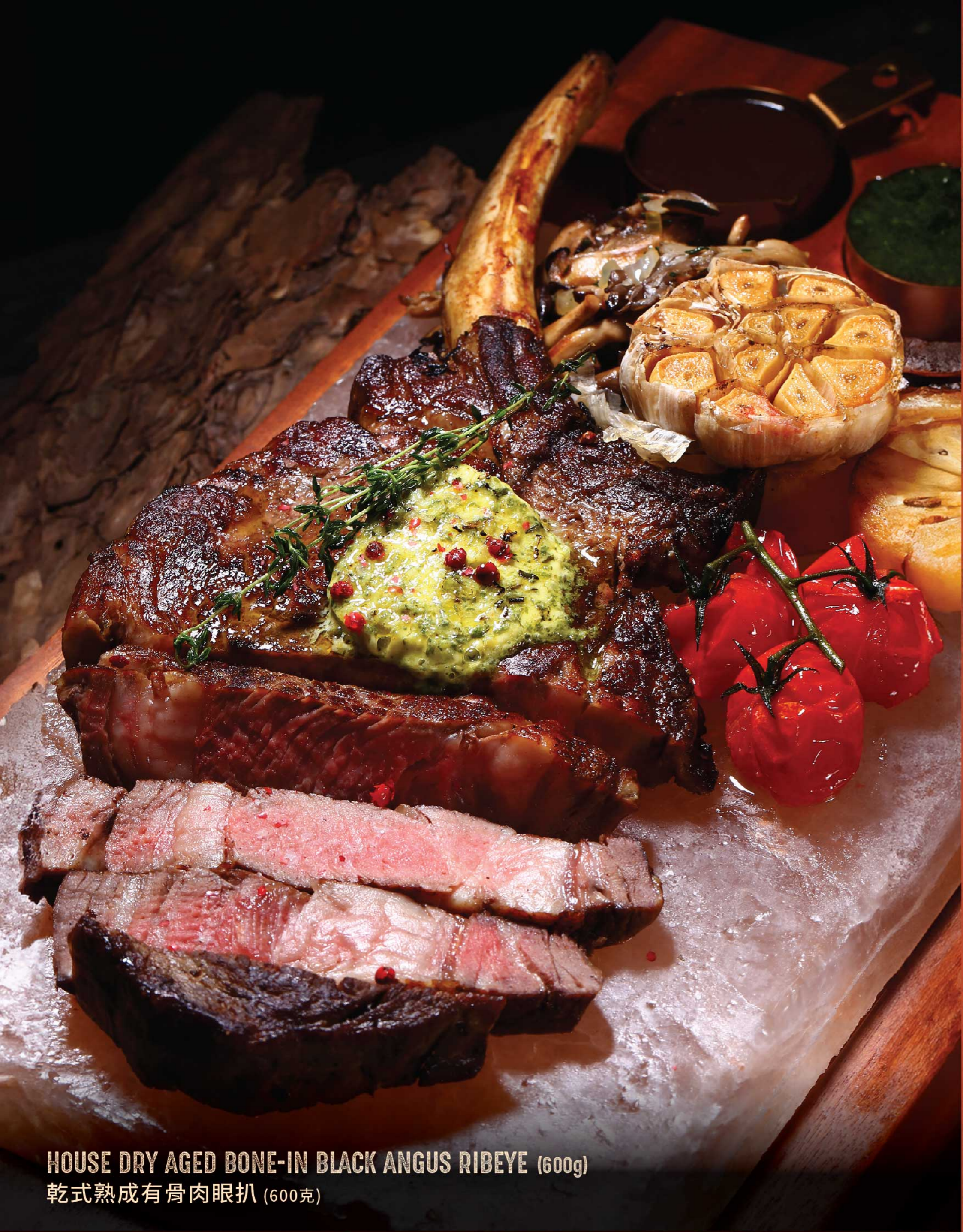
HOUSE DRY AGED BONE-IN BLACK ANGUS RIBEYE (600g) 乾式熟成有骨肉眼扒 (600克)