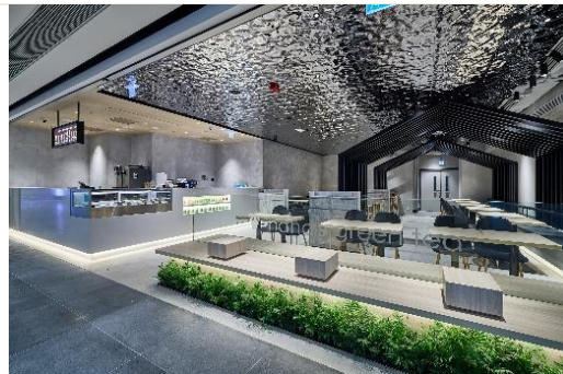
Each nana's green tea outlet is carefully designed to be unique to its location while maintaining a sense of collective unity. Harmonious settings reinforce culture and tradition amid the serene aesthetics of a modern Japanese tea ceremony