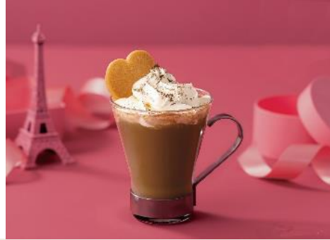
Hojicha Chocolate Latte is a must-try beverage for choco or tea connoisseurs in this season of love