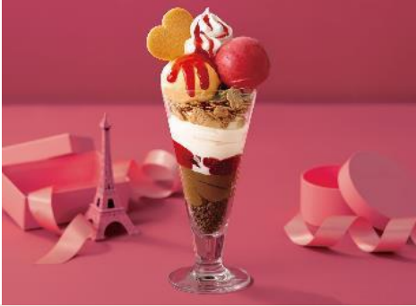
Chocolate Raspberry Parfait harmoniously blends rich chocolate and tangy raspberry sorbet