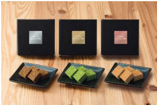
The smooth, creamy mouthfeel of Japan's famed nama chocolate enriches a special Valentine's Day box of nana's Chocolates, available in three enchanting flavours – Hojicha, Matcha and the new arrival of Roasted Soybean